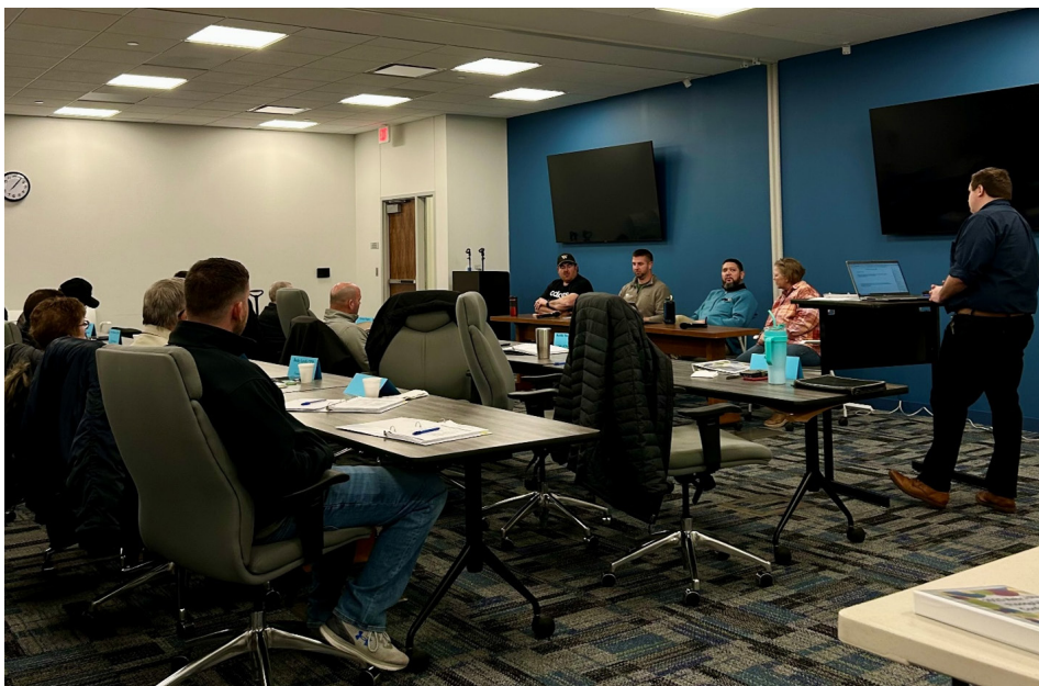
Floodplain administrator panel at the 2025 Floodplain Conference.

As with any LOMR, multiple simulations must be provided for the submittal. To ensure a valid comparison between these phases, modelers must verify