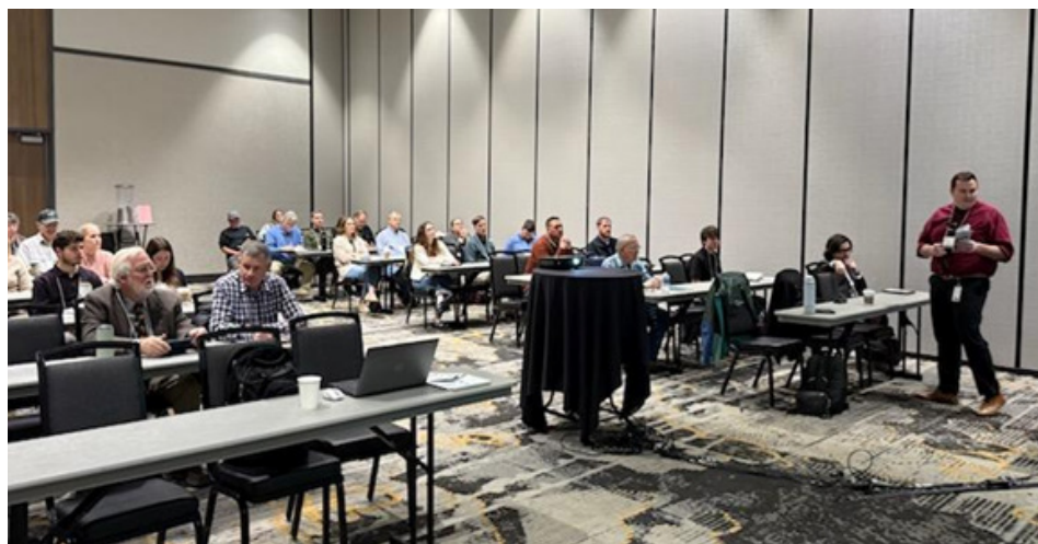
Nebraska Floodplain Management Division presenting at the 2026 Nebraska Planning Conference in Kearney, Nebraska