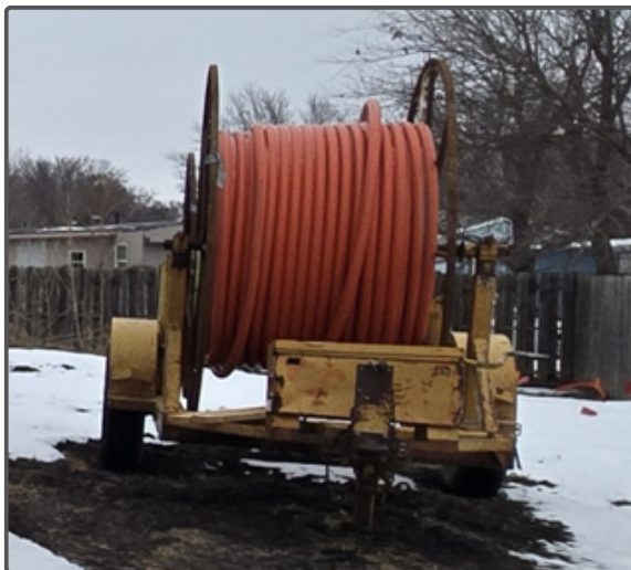
Construction equipment on a trailer, ideal for removal from site in the event of flooding.

account for any change in project scope. Over time, the requirements of an issued permit may be forgotten or procedures may need to be refreshed. Requiring a new submittal allows the floodplain administrator to check the progress of the project, to ensure contact information is up-to-date, and to verify operational or evacuation plans are still relevant. For any other questions about storage in the floodplain, please contact a member of the Floodplain Management team by clicking here .