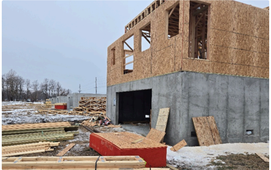
Construction site in Inglewood, NE, in the floodplain with stored construction materials.

Before permitting any development in the floodplain, floodplain administrators should review their local floodplain ordinance for guidance on meeting community standards. This local ordinance must align with Nebraska's Minimum Standards for Floodplain Management Programs Title 455. Regarding storage of materials, Nebraska Administrative Code requires that: